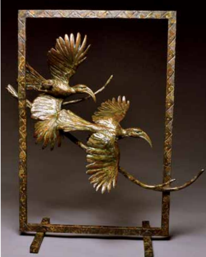
Stefan Savides , Air Africa, bronze, 31 x 13 x 38"