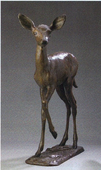
Julie , bronze, ed. of 24, 26½ x 22½ x 5"