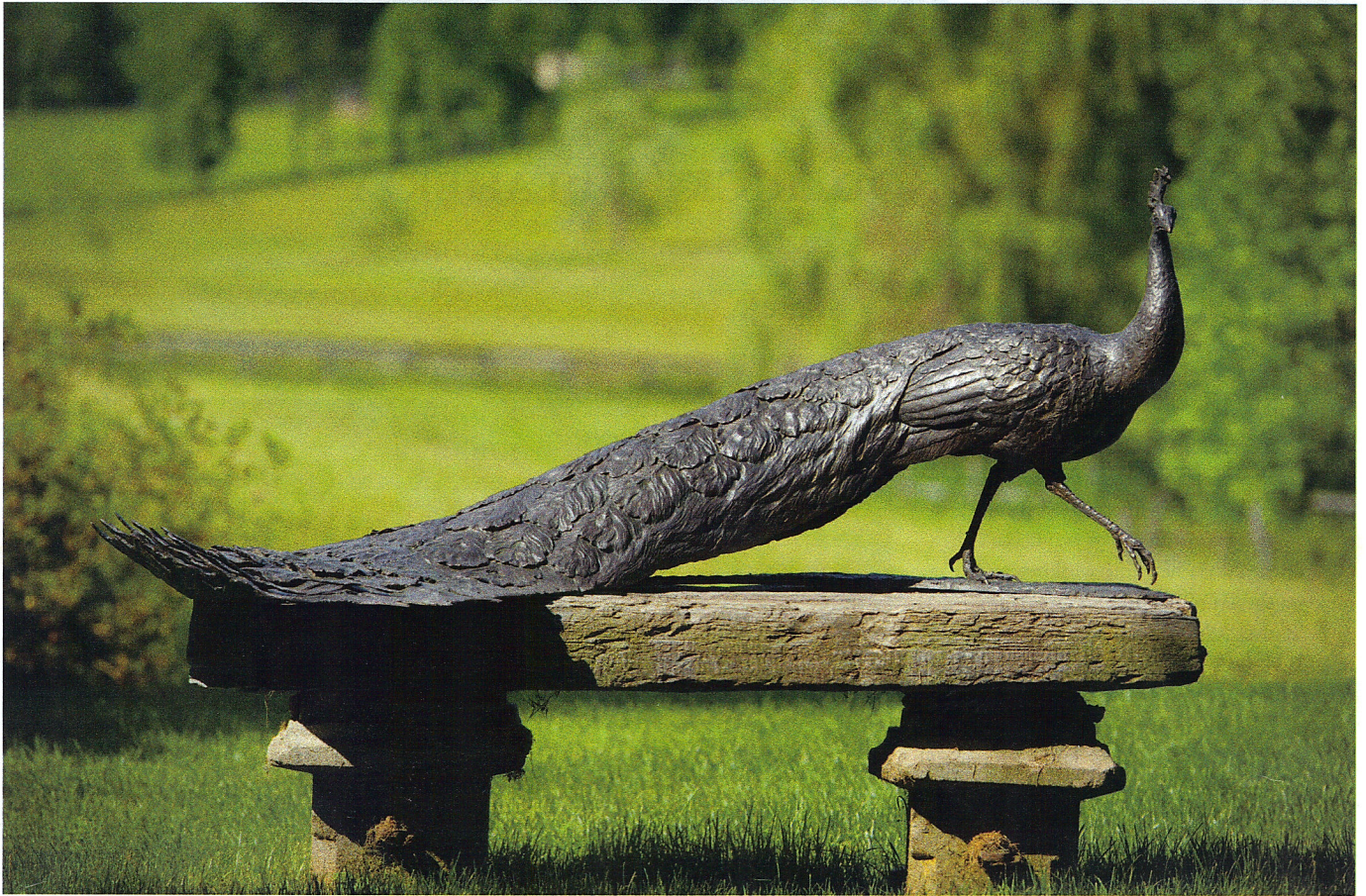
Nurejev , bronze, ed. of 12, 49 x 53 x 22"