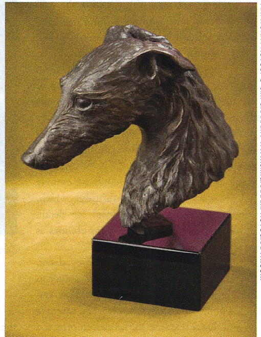
Frisky , bronze, ed. of 10, 9½ x 10½ x 5"