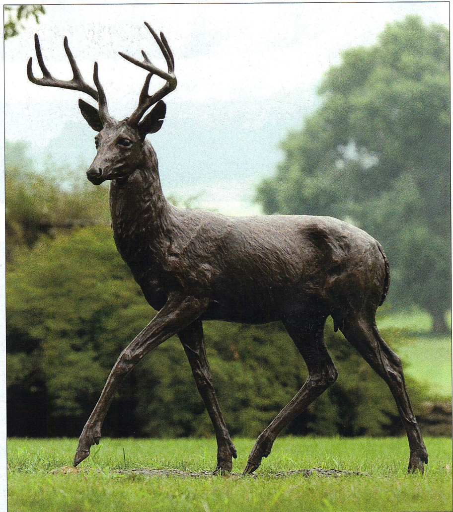
Gift in Velvet , bronze, ed. of 7, 49 x 53 x 22"

Additional bronze works available during Saunders' solo show at Somerville Manning Gallery include Alexander and Nureyev , a pair of life-size peacocks. The latter peacock was named after acclaimed Russian dancer Rudolf Nureyev whose suspended leaps and fast turns were legendary. The peacock's story, however, isn't quite as glamorous. Saunders' husband had found the peacock on the ground one evening while grilling outdoors. Turns out the bird had broken its leg, so the couple put splints on him and he recuperated in a large dog cage in the artist's studio for three months.